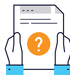
COMPLIANCE ON DEMAND Page 4