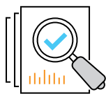
DATA-DRIVEN INSIGHTS Page 2