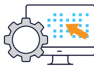
CUSTOMIZED REPORTS Page 3